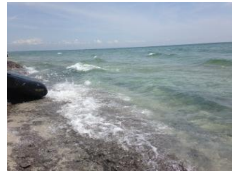
Summer at Presqu'île

Greetings, Chamber members! Wow, it's hard to believe that we are almost at the end of summer 2014! Where did it go? With the end of our busy summer season over, our fall/winter hours for the Chamber office are now 10:00 am until 4:00 p.m.